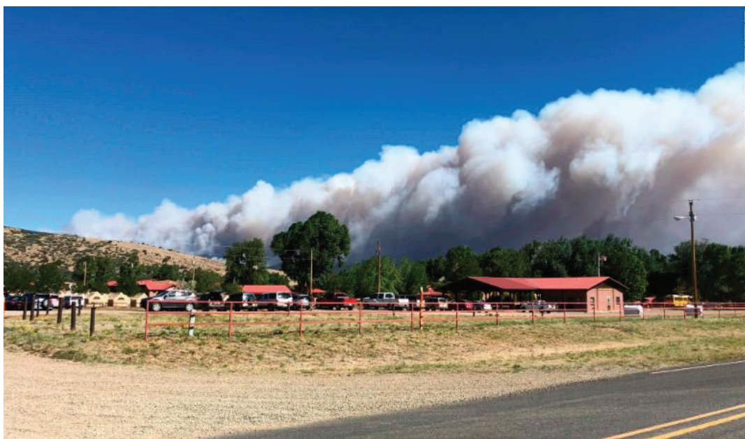
A plume of smoke from a wildfire rises behind Philmont Scout Ranch on June 1.

CNN reached out to Philmont for more details but received no response by late Monday. The Boy Scouts echoed the Philm-