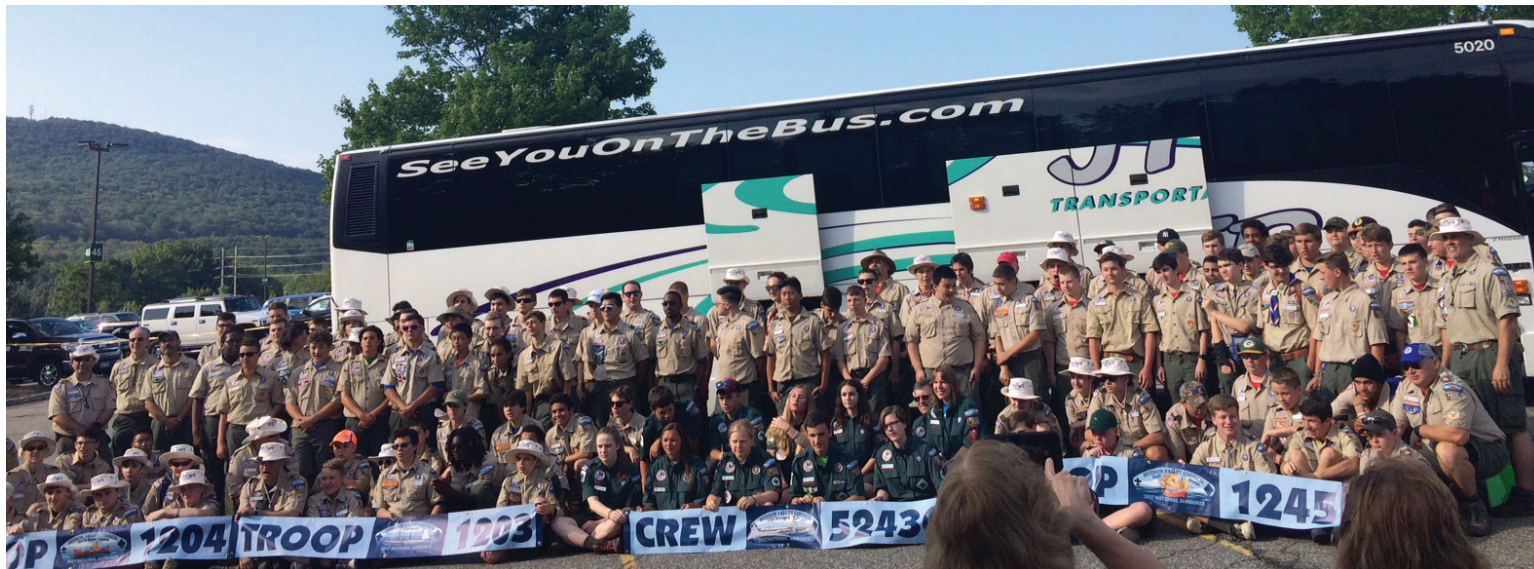
Hudson Valley Council's JAMBO 2017 Scouts are eager to get on their way to the Summit: Bechtel Family National Scout Reserve in Mount Hope, WV, for twelve days of scouting adventures!

The council has four troops and a crew heading to West Virginia on July 17. The National Scout Jamboree is a gathering of thousands of members of the Boy Scouts of America, usually held every four years and organized by the National Council of the Boy Scouts of America. Referred to as "the Jamboree", "Jambo", or NSJ, Scouts from all over the nation and world have the opportunity to attend. They are considered to be one of several unique experiences that the Boy Scouts of America offers.