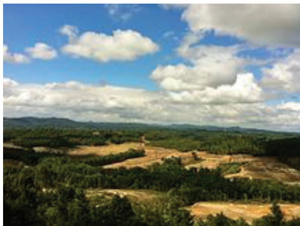
Overlook of the Summit site, cleared out before general construction in 2011

the total amount of contributions for The Summit to over $100 million in under one year.[20] A portion of the 10,000-acre (40 km 2 ) property is a reclaimed mine site once known as Gar-