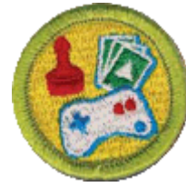
Nova Award Merit Badge