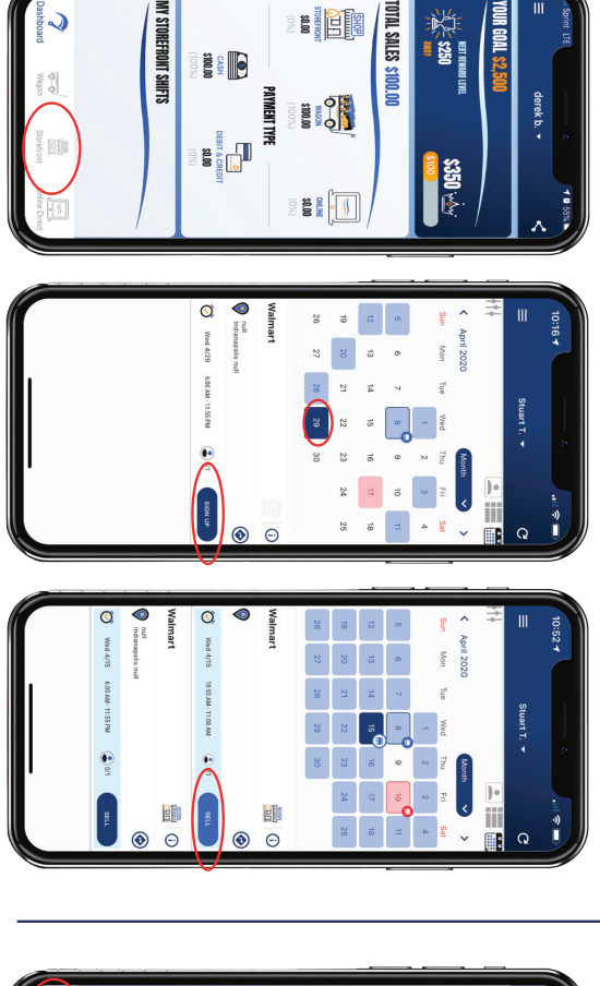
Tip: Storefront site and shift availability is managed by your unit leader. Reach out to them if you believe information is missing or incorrect.